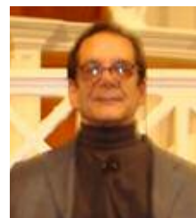
Dr. Charles Krauthammer